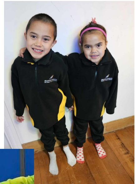
Going to miss these little angels!!