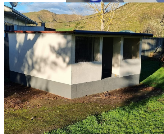
Guinea Pig cages all painted. ^